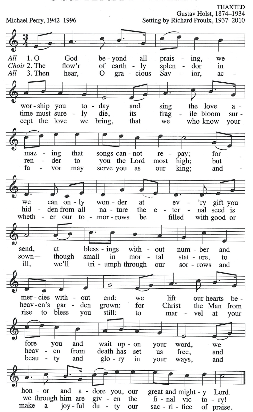
Text Copyright © 1982, 1987, The Jubilate Group (admin. Hope Publishing Company Carol Stream, IL 60188). All Rights Reserved. Used by Permission.